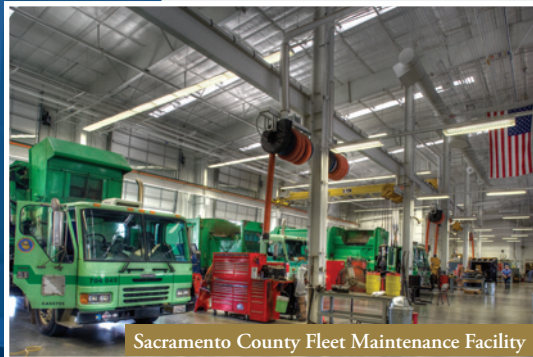
Sacramento County Fleet Maintenance Facility

services. Roebbelen is one of the largest and most respected general contractors in the Sacramento Valley and one of the few construction companies in the United States that is ISO 9001:2000 certified.